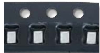
tape & reel